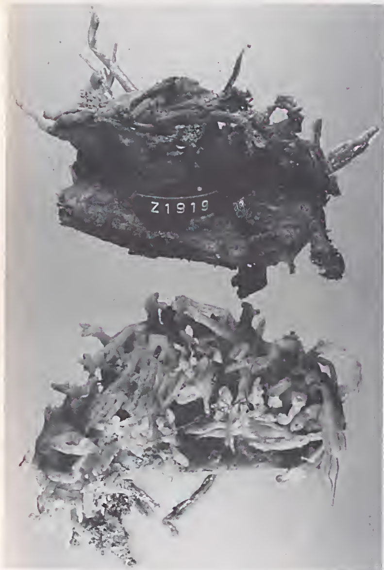
Fig. 3— Biminia macrotoxa sp. nov. Paratype NTMZ1919 130×150 mm. Specimen cut in half. Upper portion shows under-surface; lower portion shows fistules on upper-surface.

multispicular tracts, 70-110 \mu\text{m} wide, consisting of 5-10 spicules abreast. Many multispicular tracts terminate at surface, with ultimate spicules projecting through ectosome. These are crossed by uni- or pauci-spicular tracts, 10-40 \mu\text{m} in width, or other non-ascending multispicular tracts, sometimes forming rectangular meshes, but mostly irregular and confused. Spicule tracts are thickest and most densely packed on inner surface of fistule walls, 80-150 \mu\text{m} thick, with up to 15 spicules abreast. Choanosomal spongin is mainly only visible around multispicular tracts, but patches of light spongin occur haphazardly throughout choanosome.